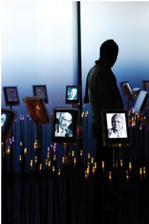
The Nobel Field

The Nobel Peace Center is made up of two main sections. The first is the Nobel field which displays all 96 laureates (Nobel prize winners) on digital LCD screens. Each screen is activated when someone approaches which begins a short presentation of the designated laureate – their contributions, history, ages, etc.