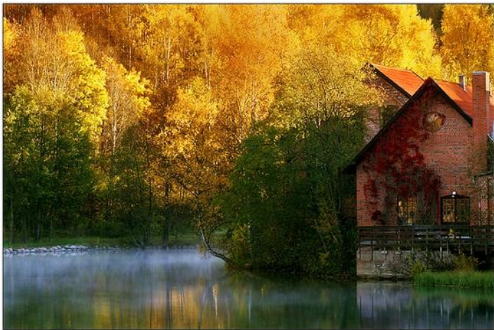
Autumn in Norway

Next Meeting: Welcome Back/Uff-da Bingo Location: New Hope Community Church 2330 Dry Creek Dr Round Rock, TX 78681