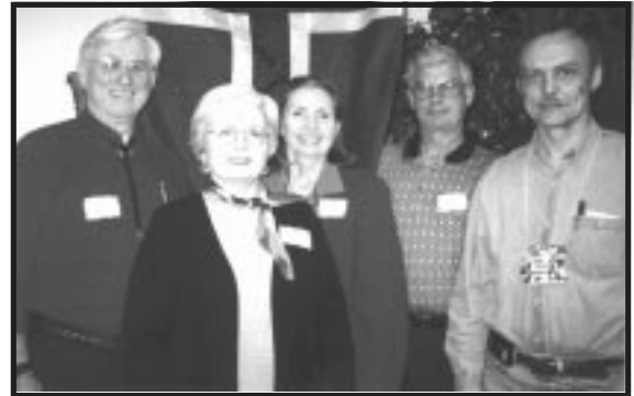
March 27, 1999

The April Meeting will be Monday (April 19th)