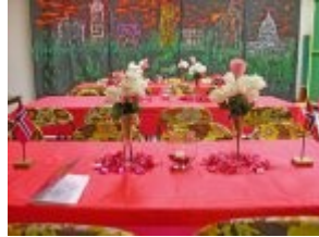
Valentine's Day Decor

The meeting had wonderful food with a Valentine's Day theme.