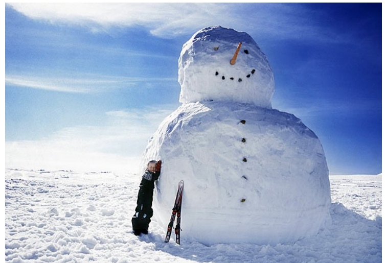
Large Snowman built in Trysil, Norway

Enter via west entrance (side water tower is on)