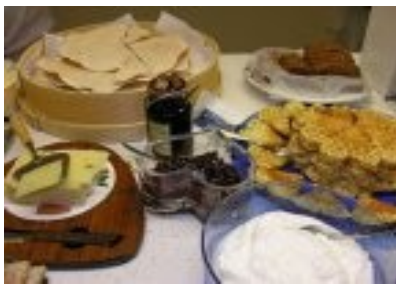
Great Norwegian Food